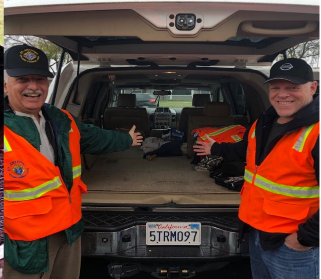
January 18 - Clergy Appreciation Dinner Night